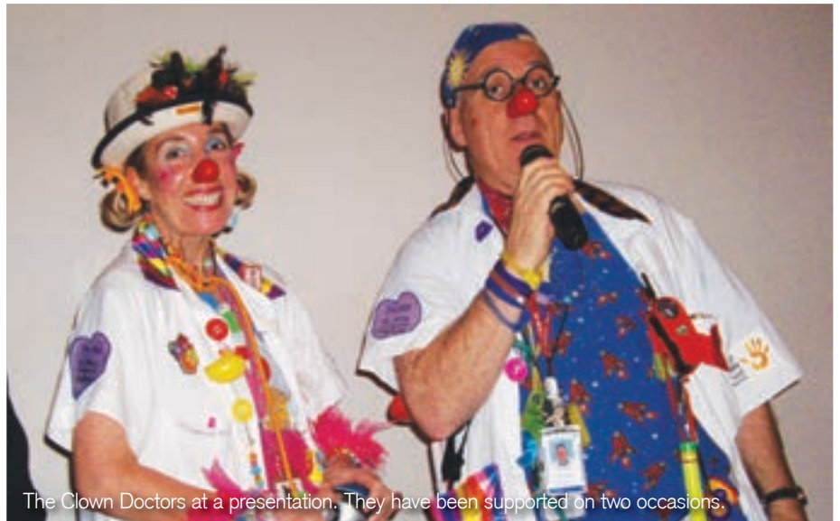
The Clown Doctors at a presentation. They have been supported on two occasions.

Funds were raised initially to assist in his recovery and ongoing support of his education. From this, the staff decided to approach management with a view to have an ongoing commitment to charity.